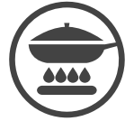
Pan Sear 煎