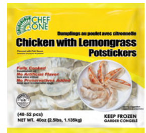
Chicken w/ Lemongrass Potsticker 香茅雞餃 1020001

A sweet and savory flavor profile with glazed teriyaki sauce and tender chicken.