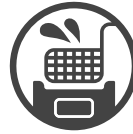
Deep Fry 油炸