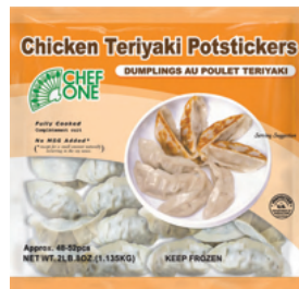
Chicken Teriyaki Dumpling 日式雞餃 1020000

A light peppery and garlic seasoning with a medley of cabbage, carrots, tofu, bean sprouts and egg.