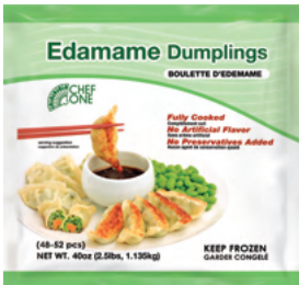
Natural Edamame Dumpling 天然毛豆餃 1020004

An unexpected refreshing flavor profile with tender chicken, fresh corn, and a hint of fresh lemongrass.