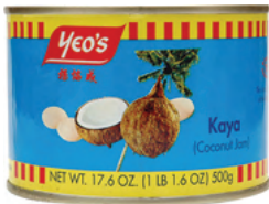
Kaya Coconut Jam 椰子醬 1021017 500 g x 12