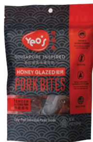
Singapore Pork Bites Honey Glazed 新加坡風味蜜汁豬肉乾