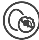
Contains Egg 含有雞蛋