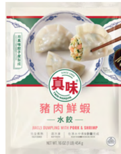
TM Jiaozi Pork & Shrimp 真味水餃鮮蝦豬肉