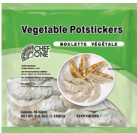
Vegetable Potsticker 蔬菜餃 1020005

A light peppery and garlic seasoning with a medley of cabbage, carrots, tofu, bean sprouts and egg.