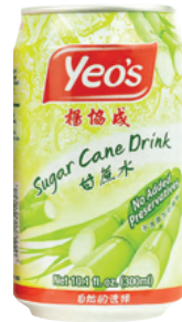
Sugar Cane Drink 罐裝甘蔗水 1020997 300 ml x 24