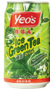
Ice Green Tea 罐裝綠茶 1020994 300 ml x 24