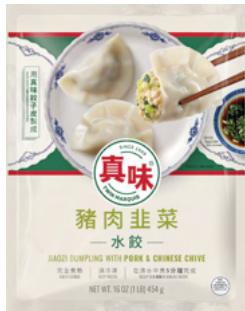
TM Jiaozi Pork & Chive 真味水餃韭菜豬肉