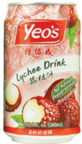
Lychee Drink 罐裝荔枝汁 1020995 300 ml x 24