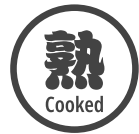
Fully Cooked 完全煮熟

為了減低微生物的生長機會和，提高食品的安全性和提供更方法的煮食方法給顧客，這些產品於生產已經加熱處理。