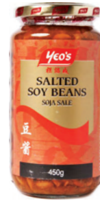
Salted Soya bean 咸豆醬