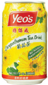
Chrysanthemum Tea Drink 罐裝菊花茶 1020992 300 ml x 24

A leading name in the Asian drinks market, Yeo's has broadened its customer reach and entrenched its industry presence through a combination of geographical expansion and product diversification. On the beverage business front, Yeo's competitive advantage lies in the Group's ability to stay true and current to consumers' changing palettes and individual preferences based on lifestyle and cultural differences.