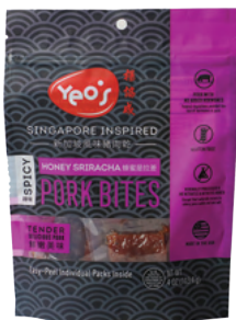
Singapore Pork Bites Honey Sriracha 新加坡風味是拉差豬肉乾