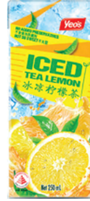
Iced Lemon Tea 紙包冰涼檸檬茶 1021010 250 ml x 6 pack x 4