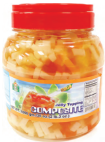
Rainbow Agar (Small)