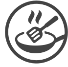
Stir Fry 炒