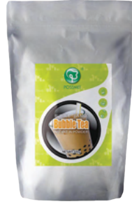
Bubble Milk Tea Powder