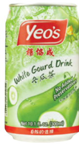
White Gourd Drink