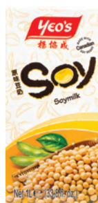
Soya Bean Drink