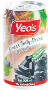
Grass Jelly Drink 罐裝仙草蜜 1020993 300 ml x 24