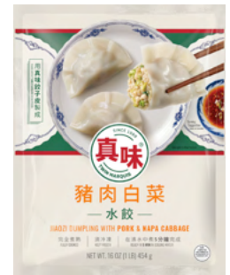
TM Jiaozi Pork & Napa Cabbage 真味水餃白菜豬肉