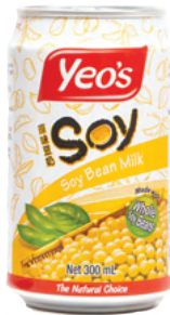
Soy milk 罐裝豆奶 1020996 300 ml x 24