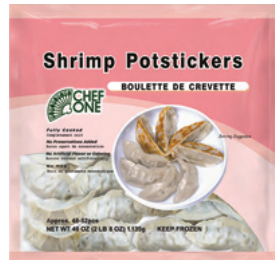
Shrimp Potsticker 蝦餃 1020010

A clean flavor profile with a blend of whole edamame beans, diced carrots, and corn.