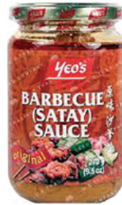
BBQ Satay Sauce 原味沙爹醬