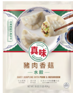
TM Jiaozi Pork & Mushroom 真味水餃香菇豬肉