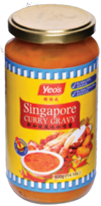
Singapore Curry Gravy 新加坡咖哩醬