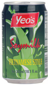
Vietnamese Style Soy milk